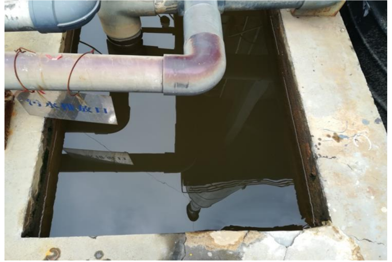
取样位置,远景镜头 SAMPLING LOCATION, FAR VIEW