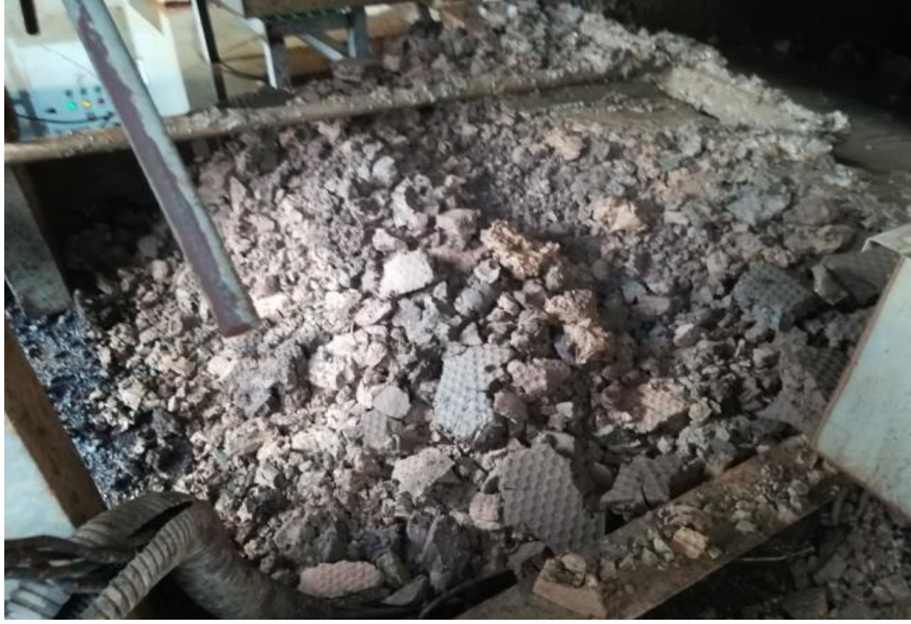
取样位置,远景镜头 SAMPLING LOCATION, FAR VIEW